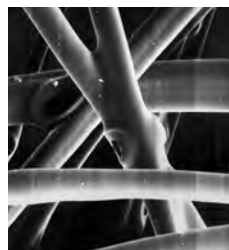
This highly magnified photomicrograph shows how each fiber intersection is solidly bonded.

Resin applied to the fiberglass during spinning is cured in an oven to form a strong bond at each fiber intersection. Bonded fibers increase compression strength, allowing air to move throughout the entire thickness of the media.