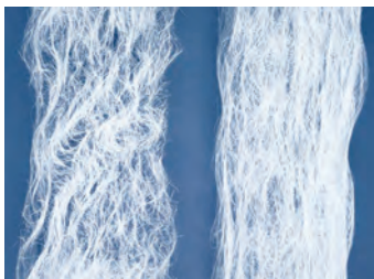
Note the difference in fiber content between FrontLine Gold media (right) and a competitive media (left).

Higher fiber content provides more dirt catching media surface.