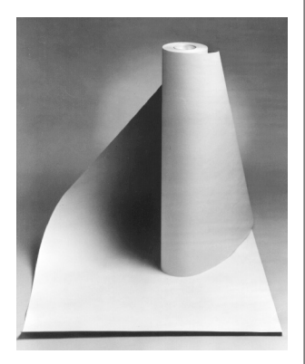
Our Paint Booth Floor Paper is available in a variety of widths.

Kraft paper available in a variety of widths to save time and money while protecting paint booth floors and surfaces from spills and oversprays.